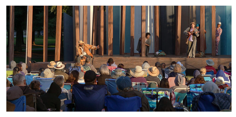
Free Shakespeare in the Park's 2019 production of As You Like It

September 2-10 on Saturdays, Sundays, and Labor Day Monday at 2pm