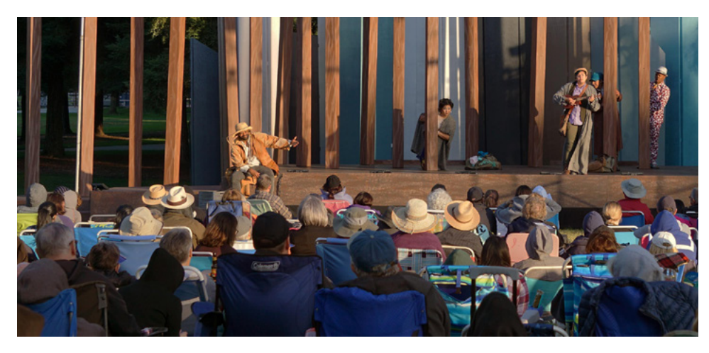
Free Shakespeare in the Park's 2019 production of As You Like It

September 2-10 on Saturdays, Sundays, and Labor Day Monday at 2pm